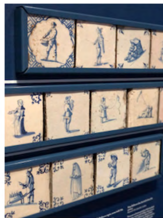
Museum De Lakenhal Van de hof van het stedelijke ambacht