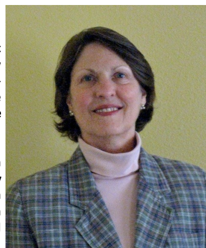
Organizing Governor Prarie Counce

Prarie Counce, Interim Governor The Pilgrim William White Society