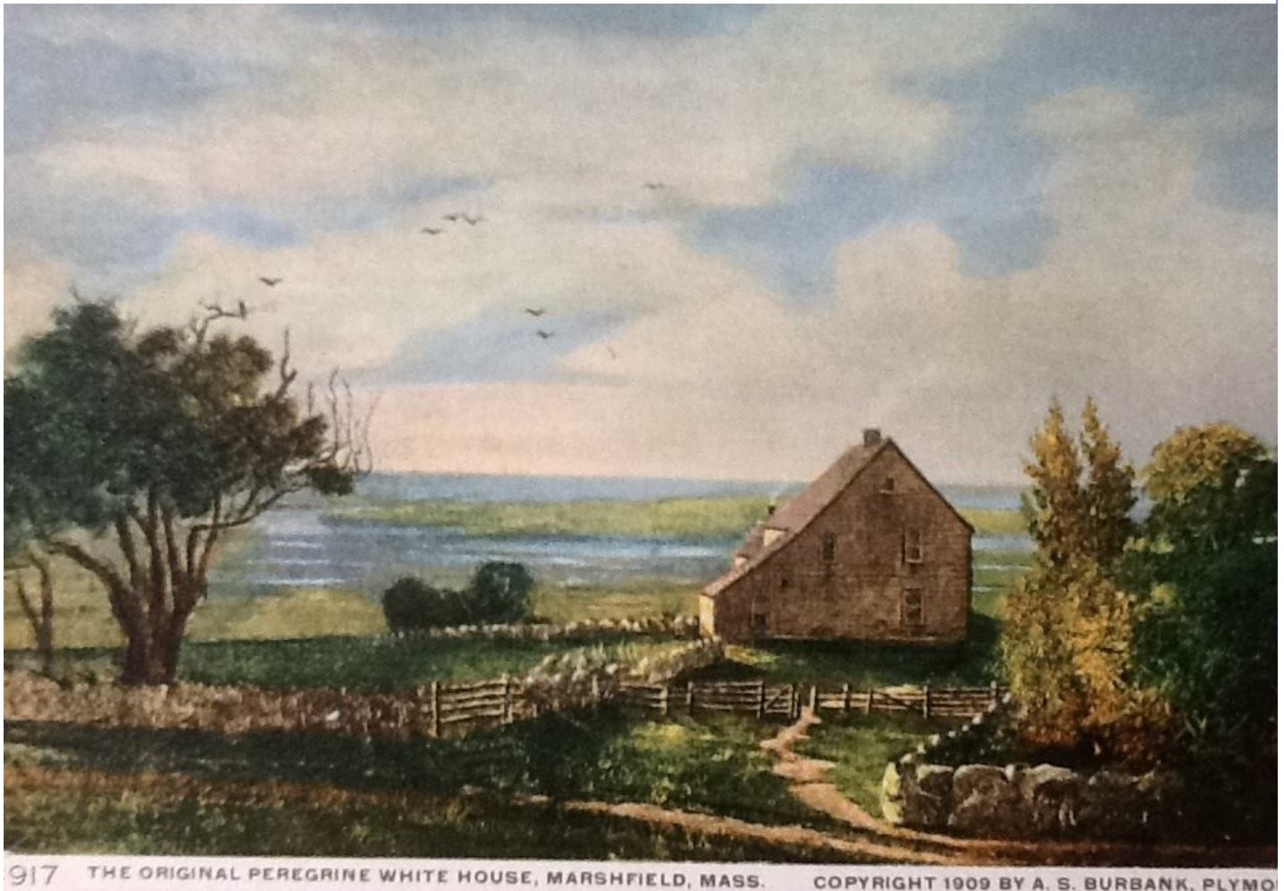
917 THE ORIGINAL PEREGRINE WHITE HOUSE, MARSHFIELD, MASS.