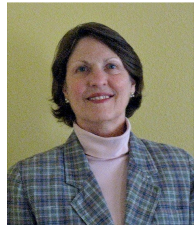
Governor Prarie Counce