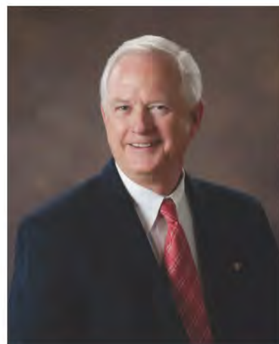
Governor Alan Smith

We the People of the United States, in Order to form a more perfect Union, establish Justice, insure domestic Tranquility, provide for the common defence, promote the general Welfare, and secure the Blessings of Liberty to ourselves and our Posterity, do ordain and establish this Constitution for the United States of America.