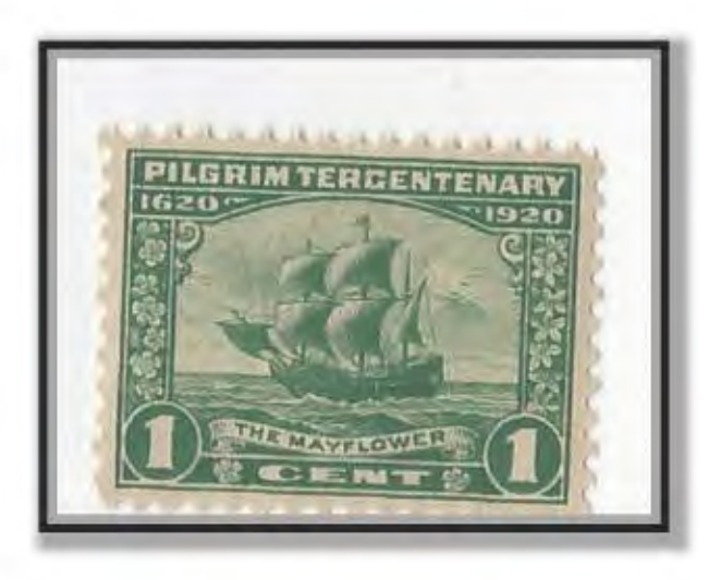
2020 Is Coming! Will you be Ready?