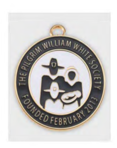
Pilgrim William White Society medal available at Hamiltoninsignia.com